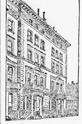
MORGAN'S LONDON HOUSE. (It Contains Some of the Rarest Art Works in Existence.)

Like most London houses there is nothing in the exterior of 13, Prince's Gate, just off Hyde Park, to indicate that it is not a most ordinary and stuffy dwelling. It is one of a solid block, all exactly alike, and separated only by the party walls. But appearances are deceptive, for the house is the London home of Pierpont Morgan, and contains most of those wonderful old masters for which Mr. Morgan has been paying unknown hundreds of thousands of dollars in the last few years, with the expectation of taking the pictures over to the United States eventually when he can come to terms with the customs authorities.