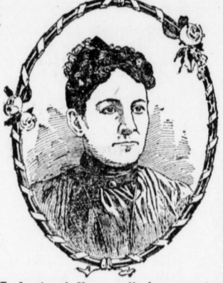
A Professional Nurse tells her experience with Doan's Kidney Pills.