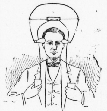
MACHINE FOR CURING HEADACHE.

No matter whether a man was out all night the night before, has strained his eyes or eaten something which does not agree with him, the resulting headache incapacitates him from duty of any sort which requires him to use his brain to any great extent.