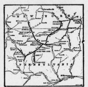
"The Grand Scenic Route."