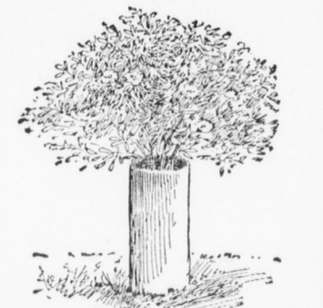
PROTECTING YOUNG PLANTS.

A tile plant protector is just the thing for holding the drooping branches of some of the small fruits up from the ground, especially the gooseberry, whose habit of growing is low and straggling.