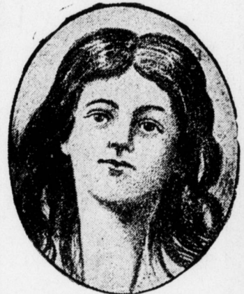
MISS EVELYN NESBIT. (Hailed by Artists as a New Type of American Beauty.)

Philadelphians are raving over a new type of American beauty exemplified in the person of Miss Evelyn Florence Nesbit, of that city.