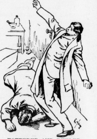
TOTTERED AND REELED.