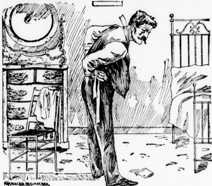
Kidney and Bladder Troubles Make You Miserable.