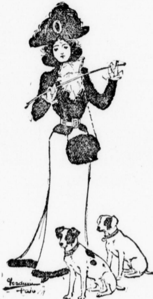
THREE CLOSE COMPANIONS.

Electric blue ladies cloth is the material employed for the development of