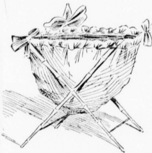
A SERVICEABLE WORKBAG.

As workbags are indispensable, new ones are always being fashioned. While this one may not be new to all, it is very likely that it will be new to many.