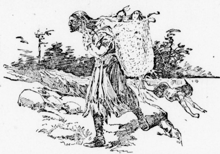
"AFTER AWHILE THE BOY WHO LAY IN THE BOTTOM OF THE BASKET SCRATCHED A HOLE, THROUGH WHICH HE ESCAPED."—Traditions of

Serious scientific men and women esting field, for the tenth annual meet- | make up the backbone of this society-