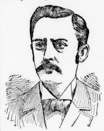
DON RAFAEL IGLESIAS. (President of the Central American Republic of Costa Rica.)

Senor Don Rafael Iglesias, president of Costa Rica, recently on a visit to this country, is a true statesman, imbued with the modern spirit of the most enlightened nations. No South American state is more wisely or just-American state is more wisely or just-ly governed than that over which Senor Iglesias presides. Unlike other coun-tries in Central and South America, Costa Rica is no breeding spot for revolution. Its politics is pure and its progress rapid and permanent. President