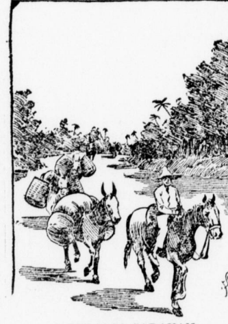
A TOBACCO CARAVAN

Apart from the secret of the soil which is beyond human cognizance and