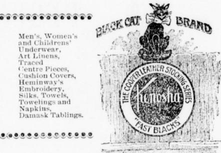
Table Cloths. Sheetings, Blankets and Bed Comfortables, Bed Comfortables, Corsets, Corset Covers, Ladies and Childrens' Muslin and Flannelette Underwear A good variety of Infants Robes.