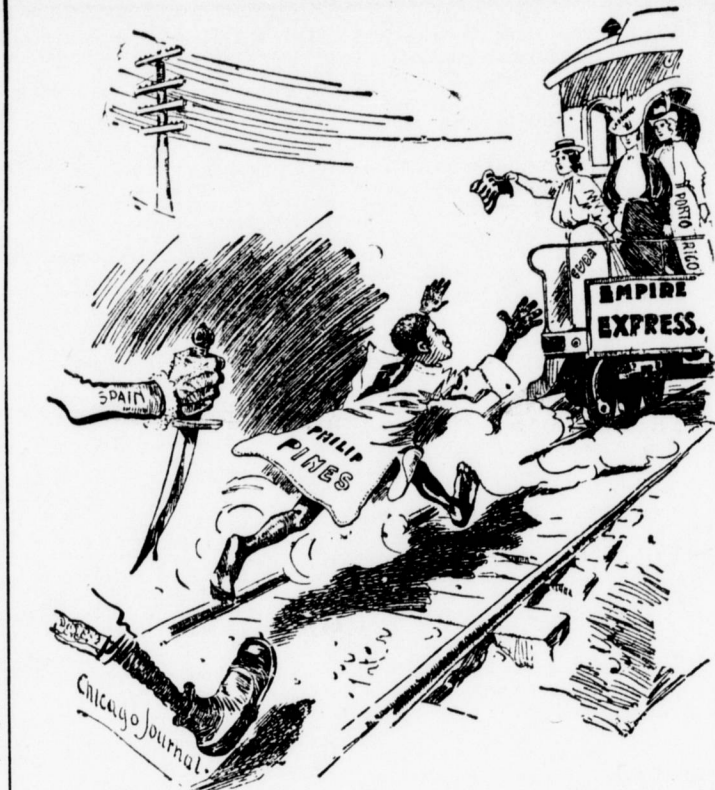
LITTLE FILIPINO ... If I Miss This Train I'm a Goner!

Many Varieties of Postcards within the last 35 years.