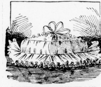
DAINTY HANDKERCHIEF BOX.

the rim is removed, line the inside of stripes or figures. A yoke of plain the box and over both sides of the cover put white sheet wadding sprinkled with lily of the valley sachet powder and tacked here and there in order to keep it in its place. The cover is to be fas tened to the box with bits of tape used not to combine it with light-weight inges, and the whole thing lined inside and outside with pale green crepe