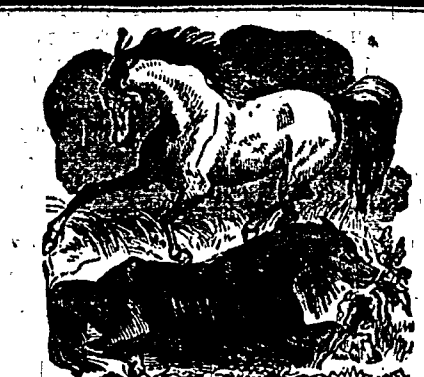
THE ORIGINAL AND GENUINE. RIRHBRIDL'S TATTERSALL'S HEAVE POWDERS.

THAS CURED, in the last year— 1500 Cases of Heaves. 2000 "Chronic Cough, 200 "Broken Wind. 5000 "Horse out of Condition, and other diseases. This remedy is put up in large packages, weighing over one pound, sufficient to administer to a horse for about 16 days, and to cure an ordinary case—thus it will be seen that it is the cheapest Heave medicine that can be given, as only one dollar's worth is requisite in most Cases to cure. We know of many who have improved the value of a heavy horse thly and some one hundred improved the value of a heavy horse thly and some one hundred improved the value of a heavy horse tifty and some one hundred dollars, by one dollars worth of the Tattersal! Heave Powders.— Only be sure to get the genuine article, and your money will be amply repaid to you. More than 500 certificates verbal and written, have been received.