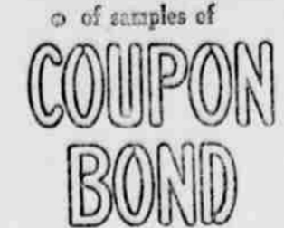
THE DE-LUXE BUSINESS PAPER

If you care about the quality, character, and impressiveness of your stationery, these samples will be valuable to you.