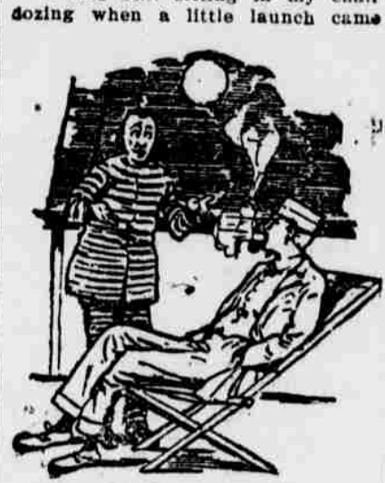
THE CONVICT APPEARS.

our way, and the next moment two gaudily uniformed officers climbed aboard and asked whether I had seen anything of a rowboat. I told them I had but that I paid no particular attention to the direction the rowboat went, which was only the truth. The question as to whether I had any stranger aboard I truthfully replied that I had not. After walking around the deck for a short time, in a manner which seemed to imply that they did not believe me, the two officers went their way in their launch.