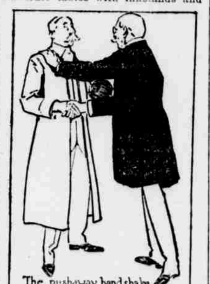
The pushway handshake.

Of course, the magnate's suite of offices contains other reception rooms, in which there are plenty of chairs, but this special room, reserved and set aside for the "quick callers," is entirely devoid of any place to sit down on. There are elaborate tables with inkstands and