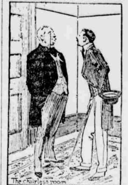
The chairless room.

The average caller who has succeeded in getting an audience with some prominent man is very apt to forget how very valuable that prominent man's time is and to feel