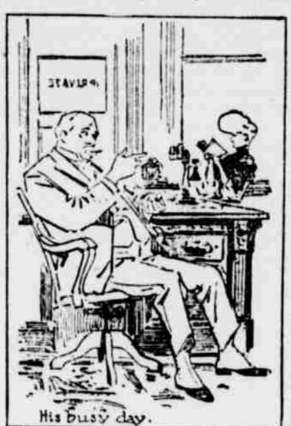
His busy day.

As, for instance, a gentleman was very desirous of seeing the president of a bank. There was no special reason why the president of