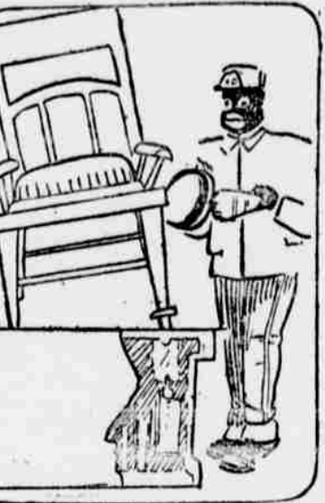
Accounts for East Shine.

Keeps Tab on the Bootblack. To a certain extent the bootblack business has taken the form of a monopoly and the most desirable locations are controlled by a comparatively few persons who are compelled to entrust the different estab-