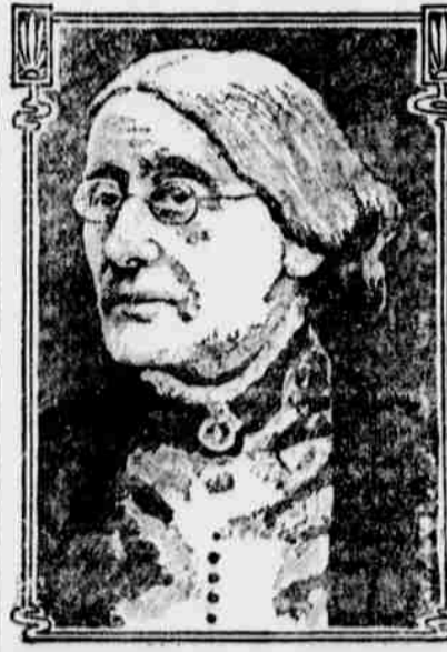
Susan B. Anthony, The venerable pioneer of the woman suffrage movement, who celebrate her eighty-fifth birthday on Feb. 15.

"If I were to judge by my correspondence," said the man who writes many letters, "I should say that the strength of the human race is being gradually usurped by the feminine portion thereof.