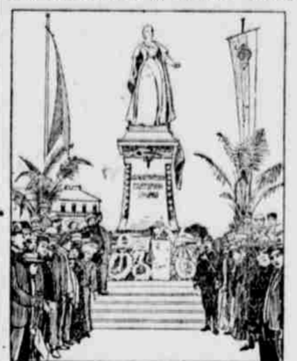
STATUE OF CATHERINE. (Erected at Vilna to Commemorate the Annexation of Poland to Russia.)

The erection of the statue was naturally not received at Vilna, a strong