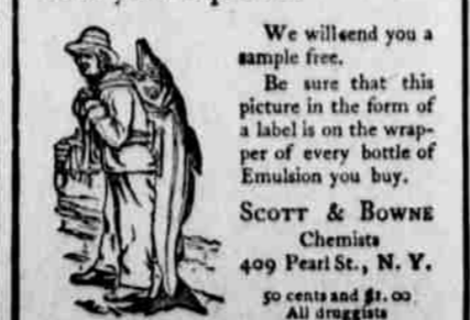
SCOTT & BOWNE Chemists 409 Pearl St., N. Y.

is such a great aid is because it passes so quickly into the blood. It is partly digested before it enters the stomach; a double advantage in this. Less work for the stomach; quicker and more direct benefits.