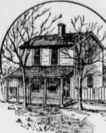
CAPITOL OF THE NORTHWEST. (Ancient Seat of Government in the City of Vincennes, Ind.)

No nails were used in its construction, it being put together by wooden pegs. Since that time improvements have been made on it which have