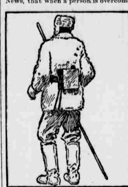
READY FOR AN OUTING. (Portable Stove, Heated by Oil, Strapped to the Back.)

It is well known, says the Chicago News, that when a person is overcome