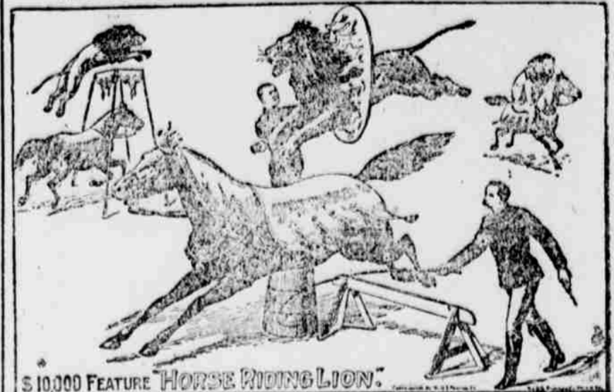
$10,000 FEATURE "HORSE RIDING LION"

Presenting the Ideal Show OF THE WHOLE World.