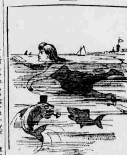
Mr. Fish—Begobs, this is the first time I've seen a mermaid wid two tails.—St. Louis Globe-Democrat.

His Other Penitence. It is a fearful thing to meet a walking dictionary.