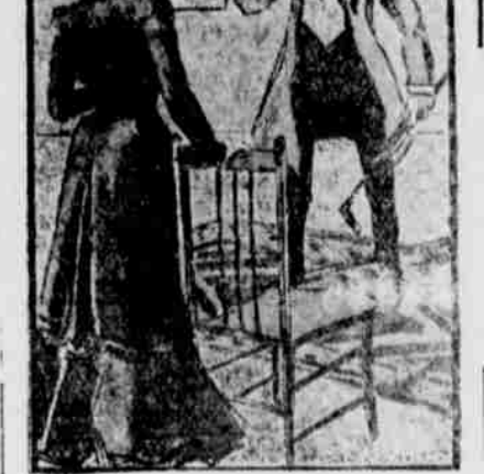
"WHAT DO YOU MEAN BY A JOKE?"

In consequence of this, it was somewhat exasperating that the clock had struck