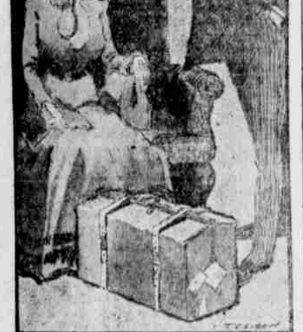
"MAY I BRING YOU SOMETHING?"

"Nothing, thank you; I am doing very well." What was the use? She had only nodded when he encountered her on the train.