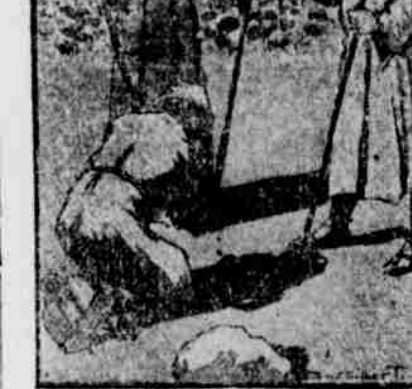
ON THE PLAINS OF BETHLEHEM.

The Christ-day is attuned to melody that ever shall thrill the soul and cause it to bring forth what is best in it. The herald song of the angels to the shepherds on the plain is fresher, stronger, closer, more harmonious than ever, in the light of the new blessings which have come from the Gospel of His peace. The lesson of real humanity, refined, Divine altruism, and not the coarser sort sometimes called by this