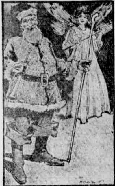
THE SANTA CLAUS OF THEIR DREAMS.

act on the hills—he approached the fairy, and in the same rough voice exclaimed: "You are to go with me on my travels to-night. Come." For a moment she stood irresolute, not knowing if this were part of the programme. Then, thinking it must be, she took the heavily-gloved hand, and, with a bow to the audience, stepped back and back, until both were swallowed up in the vast depth of the chimney. But they did not go upward. Santa Claus opened a door in the rear, and they were outside the noisy hall and in the dressing-room. Suddenly Santa Claus stripped off the heavy wings and crown from the fairy, and handed her her furs. "Come with me," he said, masterfully. "What do you mean?" she replied. "This," and he threw down the mask and wig, the fur coat and heavy gloves—before