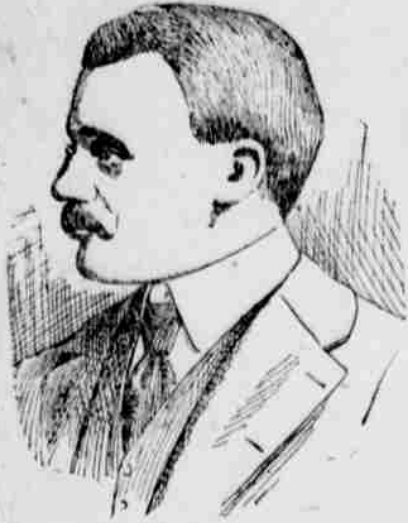
EVELYN B. BALDWIN. (In Command of the Zeigler Expedition to the North Pole.)