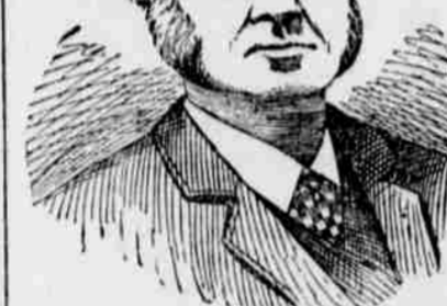
BJORNSTJERNE BJORNSON. (Famous Norwegian Novelist, Patriot and Politician.)

The motive of most of his literary productions has been a search for a vehicle to give expression to the Norwegian spirit. He has an intense dislike for the new cult of French imitation, and has been a powerful force in