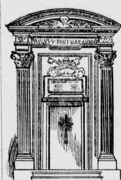
HOLY DOOR AT ST. PETER'S. (Its Opening and Closing Are Imposing Church Ceremonies.)

The ceremony of opening the Holy Door is declared to be symbolical of the fact that the church is open to all men so long as they go there after a thorough and sincere conversion. When the pope opens the door the three knocks which he gives to it represents the three continents—Europe, Africa and Asia—to which the pope offers the treasures which he is the medium for dispensing.