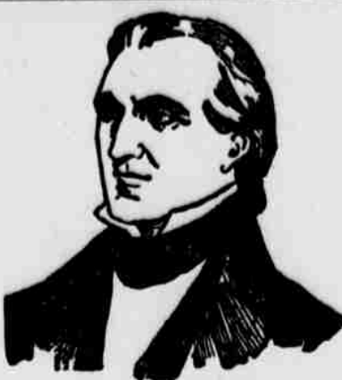
Fifty Years Ago.

Out-door life and Scott's Emulsion of Cod-liver Oil with Hypophosphites have cured thousands of cases of consumption in the early stages. They cure old, advanced cases too; but not so many, nor so promptly. When a case is so far advanced that a cure cannot be made, even then SCOTT'S EMULSION checks the rapidity of the disease, relieves the pains in the chest, reduces the night sweats, and makes the cough easier. In these cases it comforts and prolongs life. Don't experiment with cures that destroy the digestion. Pin your faith to the one remedy which has been THE STANDARD FOR OVER 20 YEARS. Book about it free for the asking. For sale by all druggists at 50c. and $1.00. SCOTT & BOWNE, New York.