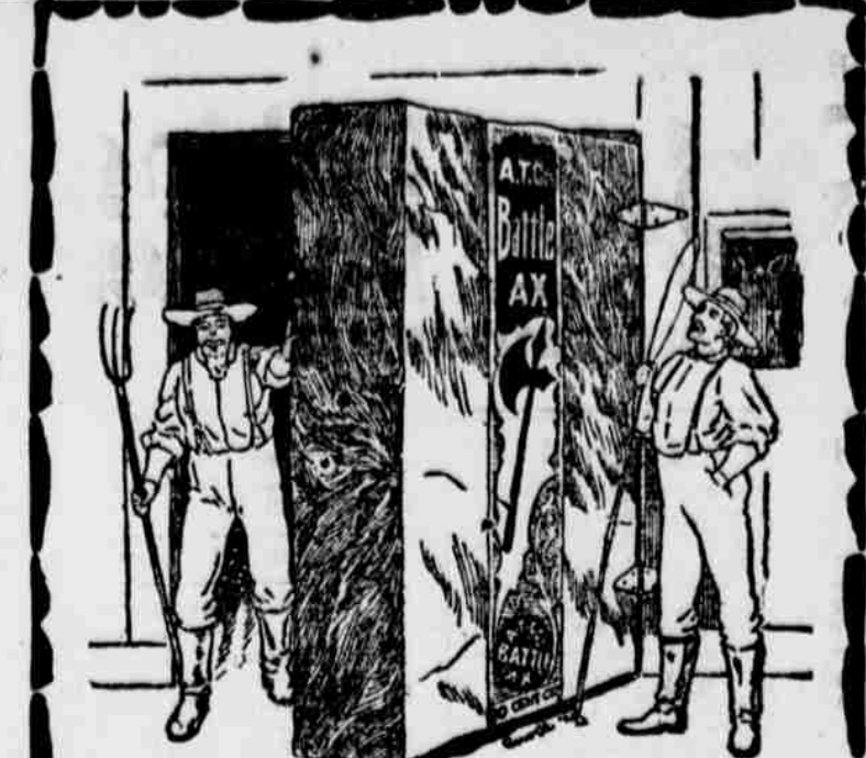
"Big as a Barn Door."

Favorite Remedy is prescribed with un-failing success for rheumatism, dyspepsia and nerve troubles in which it has cured many that were considered beyond the aid of medicine. All Druggists, $1.