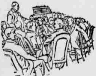
Discussing the Disaster.

There is little doubt in the minds of experienced politicians that the disaster to the Democracy has largely arisen from the cross purposes between the Democratic majority in Congress and the President.