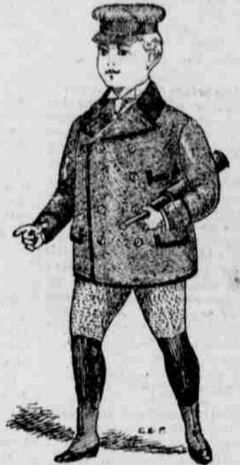
This Boys Reefer, splendidly made $2.50, 3.50, 4.00 and 5.00. Not equalled in county at price.

Fast color. Equal to custom made. See them and judge for yourself.