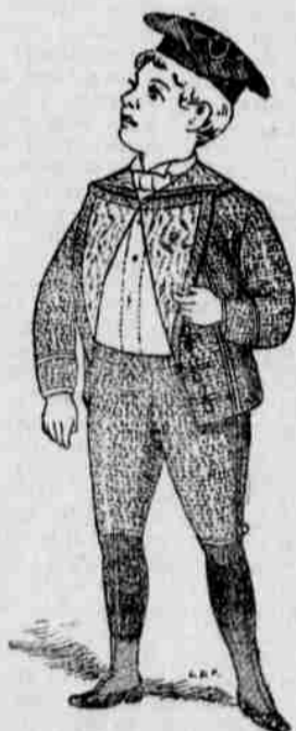
Fauntleroy Suits, blue, grey, steel $2.25, 3.00, 3.75, 5.00. An immense line, and prices 20 per cent. under other houses.