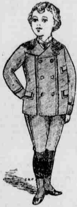
Special line of Boys Double Breasted Suits, splendidly made at $1.48, 2.00, 2.50, 3.00, 4.00 and 5.00.