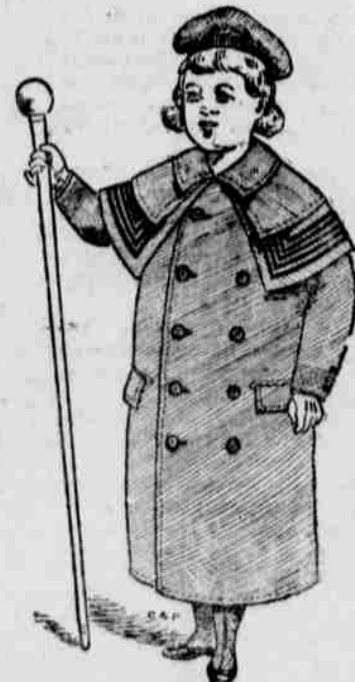
BOYS' OVERCOATS. The biggest line ever shown in this county. $1.50, 2.00, 2.50, 3.00, 4.00, 5.00, 6.00, 7.50 and 8.50. Not equalled anywhere at the price.

Regular price $10.00 at any other house in the county.