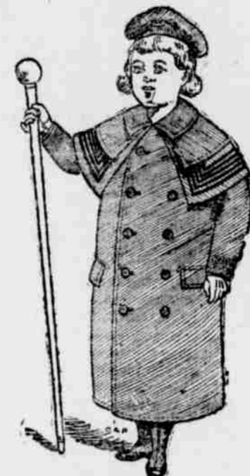
OVERCOATS. The handsomest line we have ever shown. The newest out is the Triple Cape Detachable. We have them at $3.00, $4.00, $5.00, $6.00 and $8.00. Cheaper ones if you wish at $1.50, $2.00 and $2.50.

A collection of clothing, hats and furnishings for men, boys, and children, unequalled for style, quality and price.