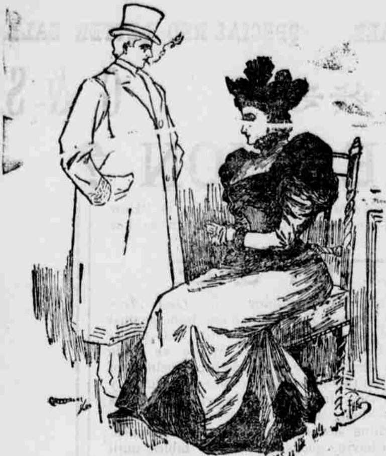
AN EFFECT IN SKIRT TRIMMING.

the side of each front were three narrow satin rolls, put on in a semi-circle, and finished at each end with a small chon. In spite of the fact that the ruffles are so odd, one sees them, extremely narrow, on many a skirt, put on very far apart. A very dainty arrangement for an afternoon at-home gown is a series of lace tabs, arranged about the skirt. The tabs are three or four inches wide at the hips, and gradually narrow into a point at the bottom of the skirt. Three tiny satin folds put on in semi-circles, in points, or in a border that resembles the Greek somewhat, except that it is very much freer and larger in design, are seen very often. These are very simple and girlish, and harmonize well with the plain, full black skirts. The double ruffle, or ruche, caught down through the middle with a band of fur or other trimming, is also used considerably, but should be placed at the very bottom of the skirt.