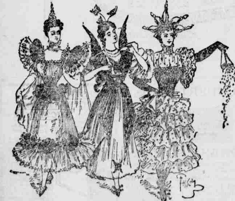
MYOSOTIS, BUTTERFLY AND MISS COMPIT.

pretty as she stepped from her carriage to attend a select "Sunday afternoon." The fawn was very clear, light shade; and its skirt had two rows of flat ruffles of deep cream lace, tipped with narrow satin bands in pale azure. The hat was a broad, soft white, with a blue plush crown, very flat, with great white plumes at the side. A narrow blue rim rested on the hair beneath.