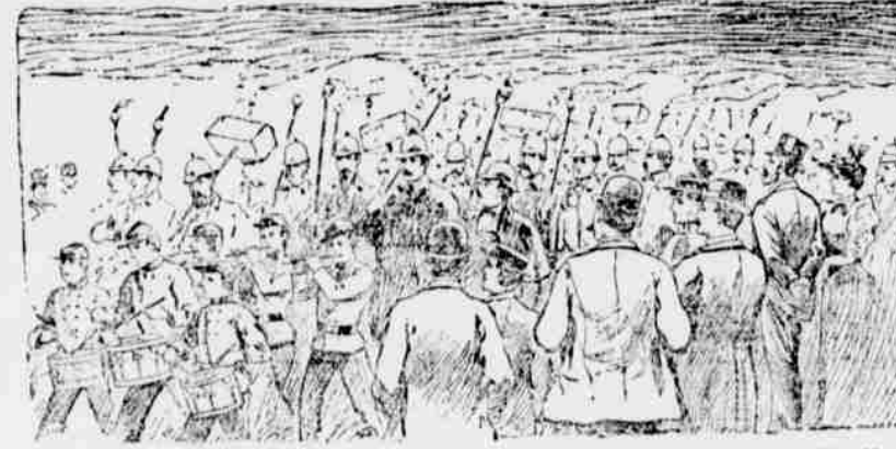
THE REPUBLICAN PARADE THAT DID NOT TAKE PLACE AFTER ELECTION