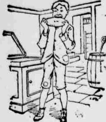
MAKING SHORT WORK OF IT.

You say he would, anyway, whether it came from Jacobs' or not. Yes, he might, but it pleases him better, and our Bread, Cakes, Pies, Ice Cream, Candies, &c., will please you better than any you can secure elsewhere. We aim to make everything as nice as can be made, and our continued and increasing patronage shows how well we succeed in pleasing customers