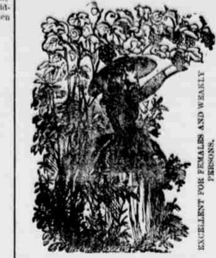
Speer's Port Grape Wine! FOUR YEARS OLD.

Used in the principal churches for communion purposes. Excellent for Ladies and Weakly Persons and the Aged.