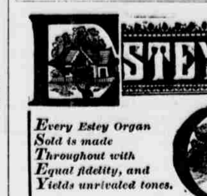
Every Estey Organ Sold is made Throughout with Equal fidelity, and Yields unrivaled tones.

SUBSCRIBE NOW FOR THE COLUMBIAN $1.50 A YEAR.