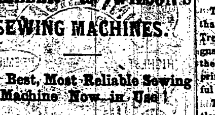
The Best, Most Reliable Sewing Machine Now in Use!

These Machines make the lock-stitch alike on both sides, and use less than half the thread and silks than the single or double thread loop-stitch Machines do. It will Stitch, Hem, Fell, Quilt, Tuck, Plait, Gather, Cord, Braid, etc., all without previous basting; and are better adapted than any other Sewing Machine in use to the frequent changes and great variety of sewing required in a family; or they will sew from one to twenty thicknesses of Marseilles without stopping, and make every stitch perfect; or from the finest gauze to the heaviest beaver cloth, without changing the feet, needle or tension, or making any adjustment of machine whatever!