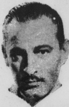
JOHN Barrymore as the Dean Brunel thief—