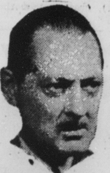
LIONEL Barrymore as the bulldog of the police in