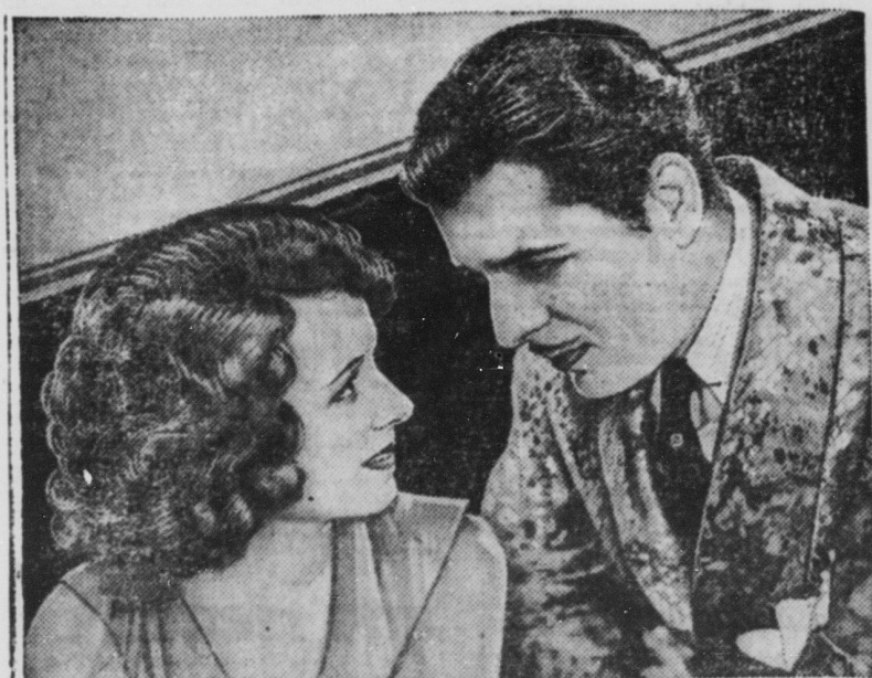
Misunderstanding becomes a barrier to the love between Janet Gaynor and Warner Baxter in the Fox romance, "Daddy Long Legs."

Monday, Tuesday, Wednesday June 29--30, July 1