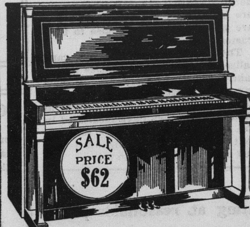
Another Piano bargain—now $62. Several of these on hand that must go at once. You can pay weekly or monthly or any way that your income permits. A real bargain.

A sale of slightly Used Upright Pianos and Play- ers. You can se- lect a piano at $55.00, $47.00, $59.00 and up. Players $98.00 and upwards. Easy terms on all goods.