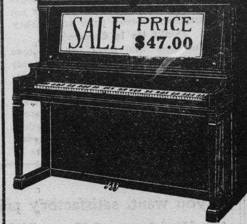
This bargain now $47.00. Play as you pay. You can give your child an opportunity to become a musician by paying $1.00 weekly on a Piano.

You can own a desirable player like this for a few cents a day. 30c a day will pay for this player. You name the terms. Make your first payment pay day.