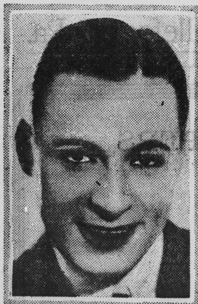
ROD LA ROCQUE