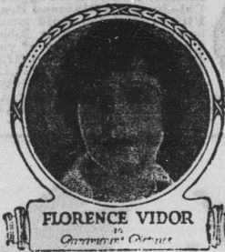
FLORENCE VIDOR Greatest Actress