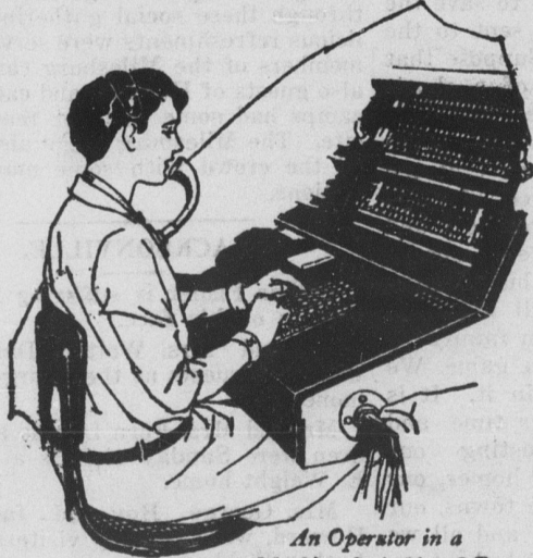
An Operator in a Machine Switching Office