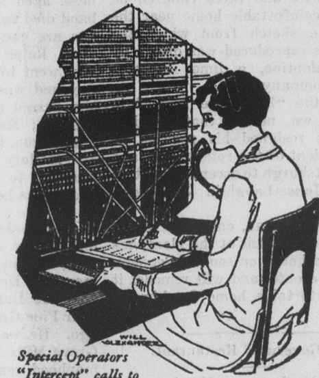
Special Operators "Intercept" calls to numbers which have been changed