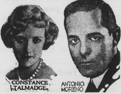
CONSTANCE TALMADGE ANTONIO MORENO

This Venus has two good arms—and how she uses them! If they aren't around some fellow's neck, they're in his pocket—and when she makes her gondola getaway, she has all the traffic cops of Venice swimming around in circles. A great comedy drama. We know you would not think of missing it.