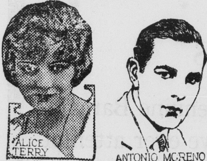
ALICE TERRY IN ANTONIO MORENO REX INGRAM'S PRODUCTION