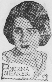
NORMA SHEARER and OSCAR SHAW IN

This Friday and Saturday METRO-GOLDEN PRESENTS