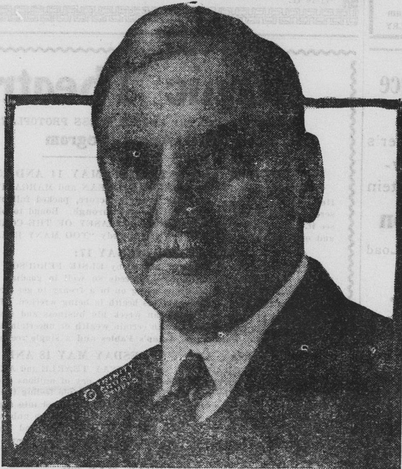
GEORGE WHARTON PEPPER

Cut This Out Take It Into the Booth With You and Mark Your Ballot This Way