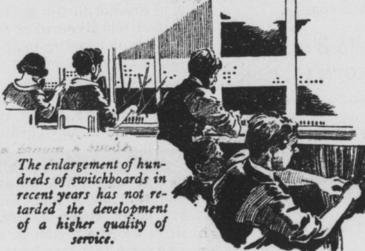
The enlargement of hundreds of switchboards in recent years has not retarded the development of a higher quality of service.

TODAY your telephone "talks" better than twenty or ten or even five years ago. Your voice travels with more force, greater clearness — what the telephone engineers call "better transmission."