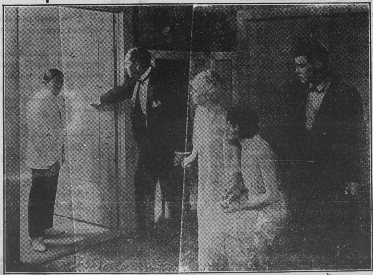
SCENE FROM "THE BAT"

Prices 50c., $1.00 $1.50. $2.00—plus tax. Phone Mott Drug Co. for Your Reservation—Now