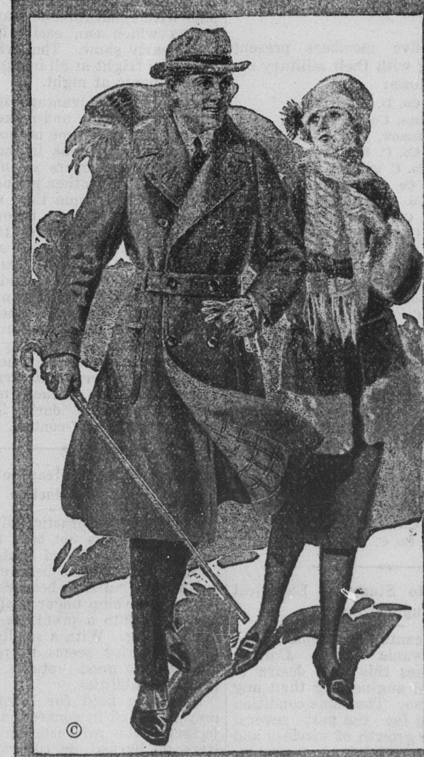
Showing one of the new Overcoat Models for Fall and Winter. Soft fleecy fabrics that drape perfectly. Silk trimmed and rain proofed in all weights. Models, sizes and shades to conform to every taste and figure.