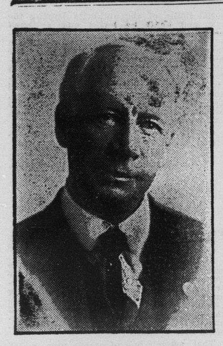
ELISHA KENT KANE INTERNATIONAL PEACE.

Having by its agitation, and by electing to Congress one man, Charles H. Randall, accomplished its first two objects, Prohibition and Woman Suffrage, the Prohibition party now champions International Peace. It wants prohibition of warfare with other countries and among ourselves at home, peace on earth, good will to men.