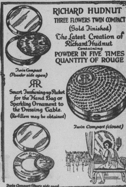
The Mott Drug Co.